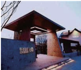
Property development and investment properties