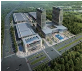
Building works, constructions and materials supplies

As at 31 December 2021, the Group has six main segments, which are (i) foundation works, superstructure building works and construction materials supplies; (ii) property development and investment properties business; (iii) properties management; (iv) F&B supply chain; (v) health and wellness services; and (vi) smart logistic and information technology development. We seek to achieve synergistic value amongst the segments in order to obtain higher returns and greater business opportunities.