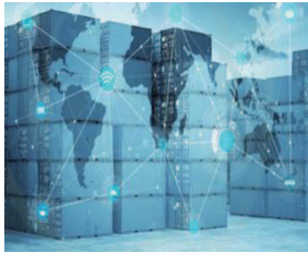
Smart logistic and information technology