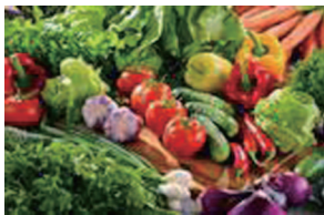
F&B supply chain