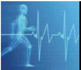
Health and wellness services